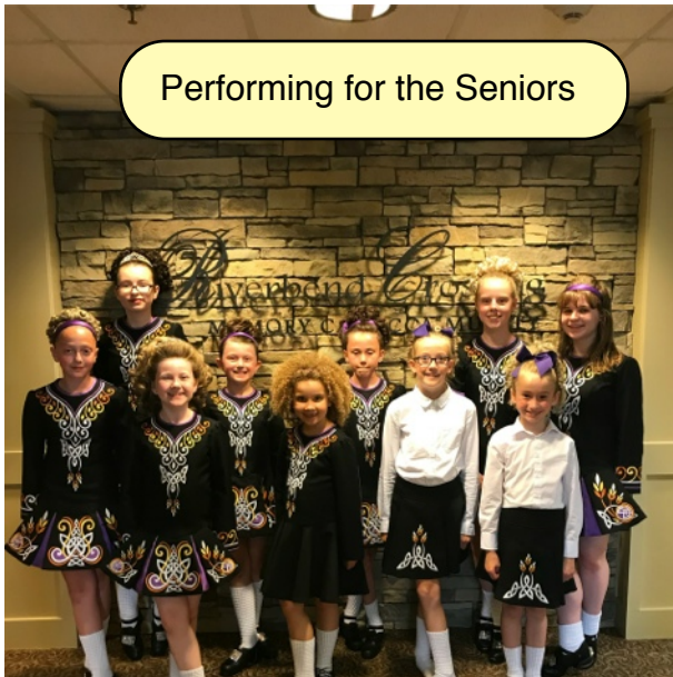
Performing for the Seniors