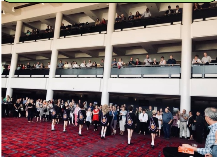
Celebrating Irish Culture with Celtic Woman