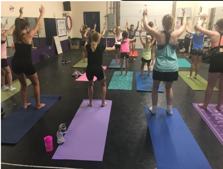
Yoga helps our balance and strength!!